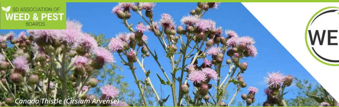
Canada Thistle ( Cirsium Arvense )