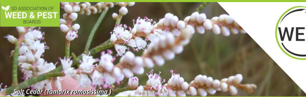
Salt Cedar (Tamarix ramosissima)